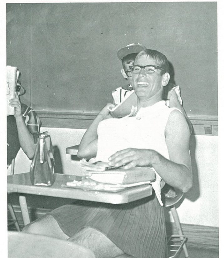
Speaking of False Charm