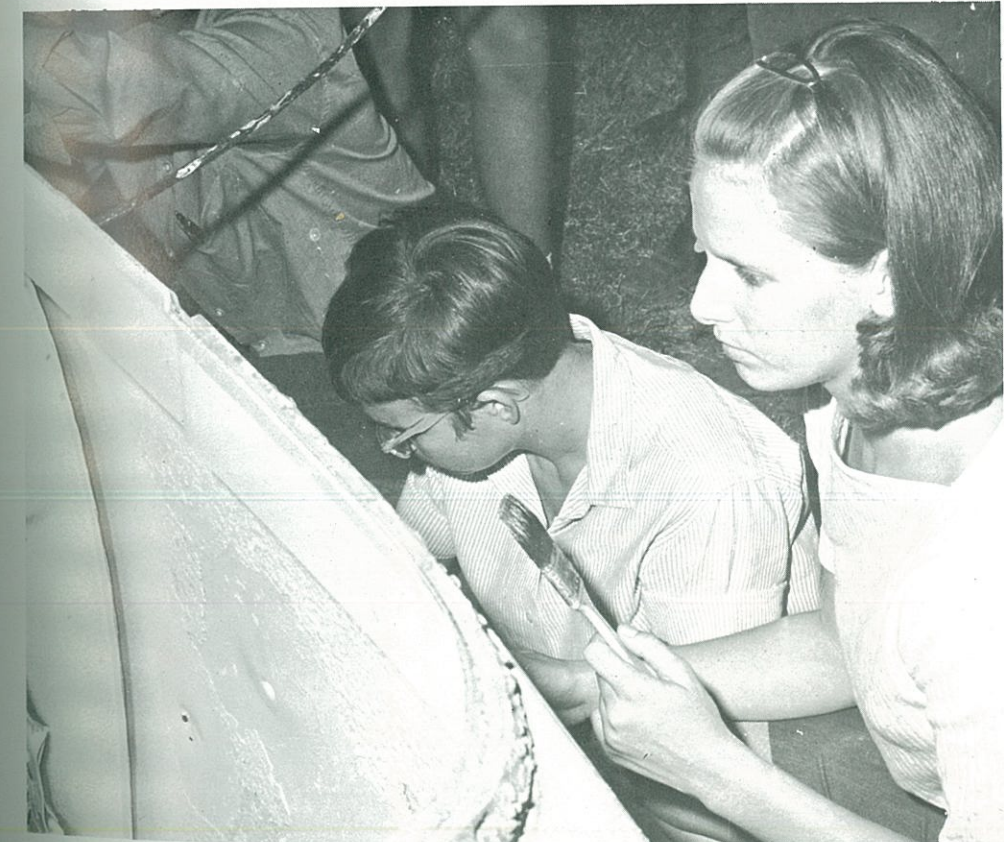
Junior Pop Art Painters