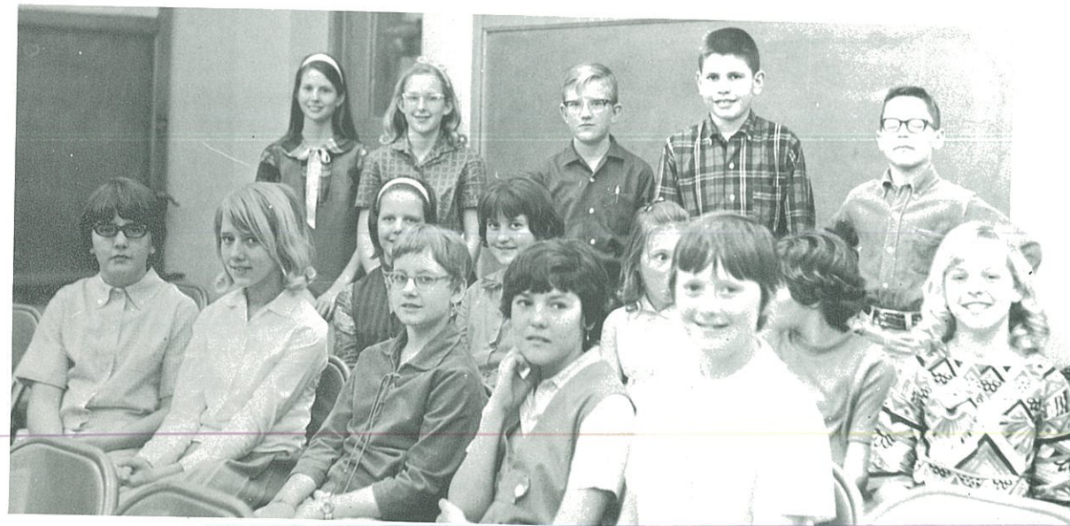
Good spellers for interscholastic league.