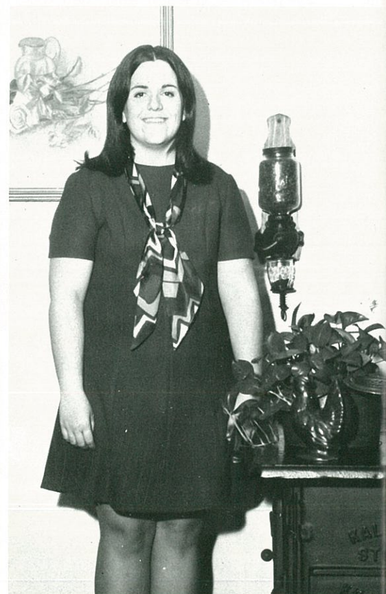
BETTY CROCKER HOMEMAKER AWARD