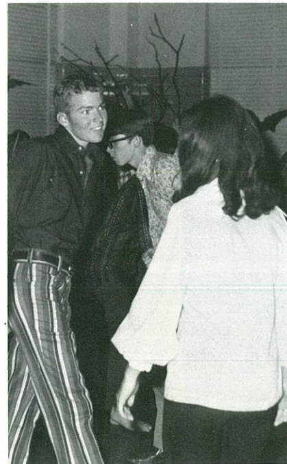
"Put your little foot"?