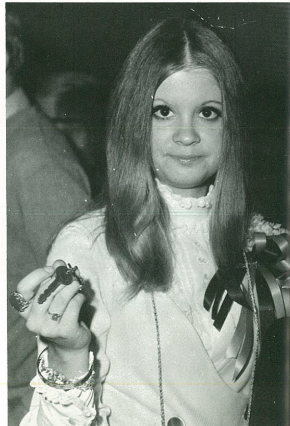
Here's the Key to my Heart . . .