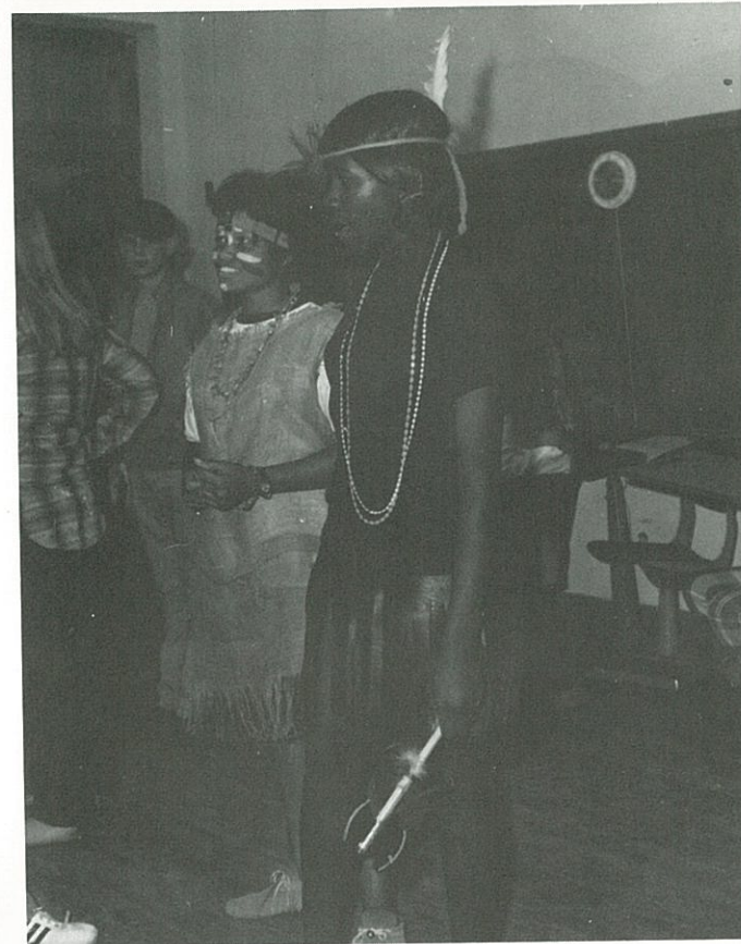
Me want 'em scalp.

No more classes No more books No more teacher's dirty looks. No more getting out of bed, When our eyes feel like lead. No more checking length of skirts No more tucking in of shirts. No more things we have to do Because we're the Seniors of '72! Seniors on Annual Staff