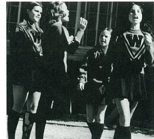
See if I care!