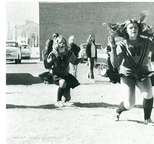
3 ... 2 ... 1 ... Blast-off!