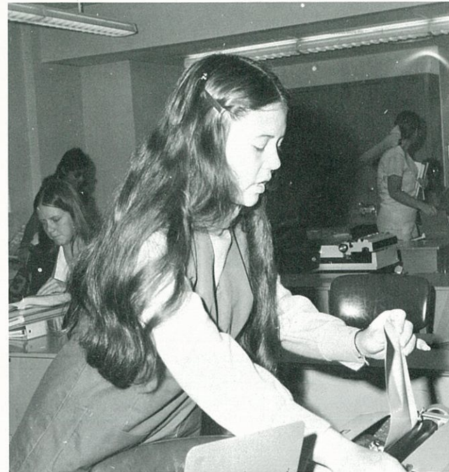
That's the fifth sheet it's eaten today.