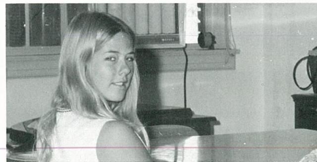
Momma never told me about Ultra Brite!