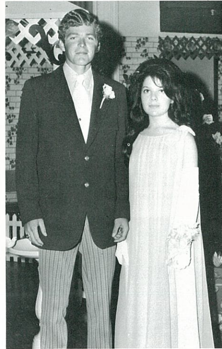
Eat your heart out, Ryan O'Neal!