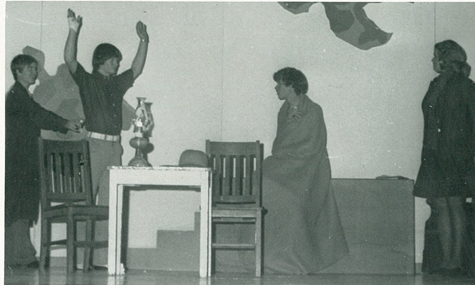
You can't scare me with that water gun!