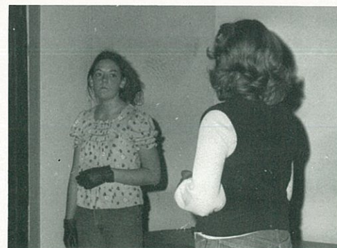
I wear gloves to prevent dishpan hands!