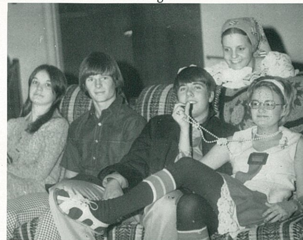
Pass around the beads and we'll all take a bite!