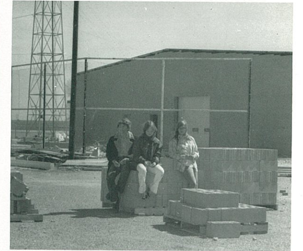
A new auto mechanics Building for '76-77