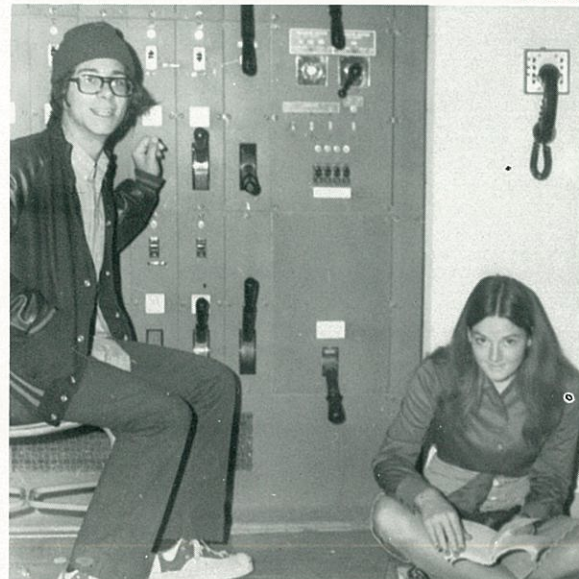
I can plunge the whole world into darkness!