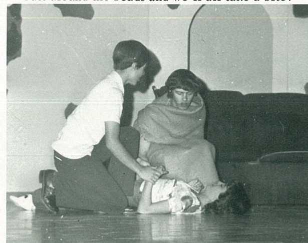
She hasn't had a good night's sleep lately!