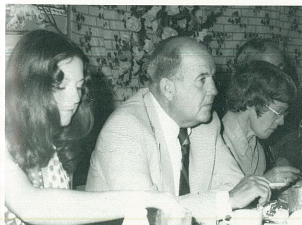
So they can sit by pretty girls!