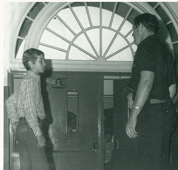
I'd bring the teacher a dead fish!