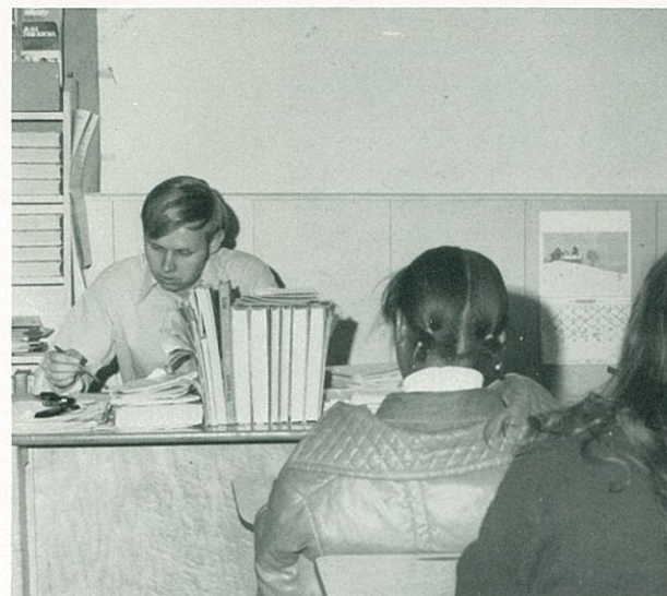
Maybe he could use some candy!