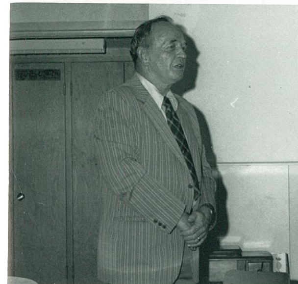
To become Saints!