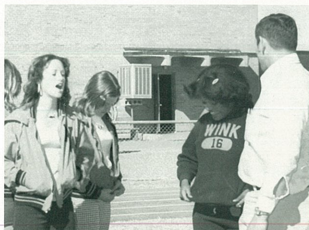
I'd sing my best solo!