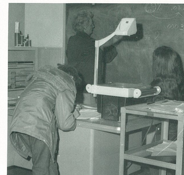
They love to explain things!