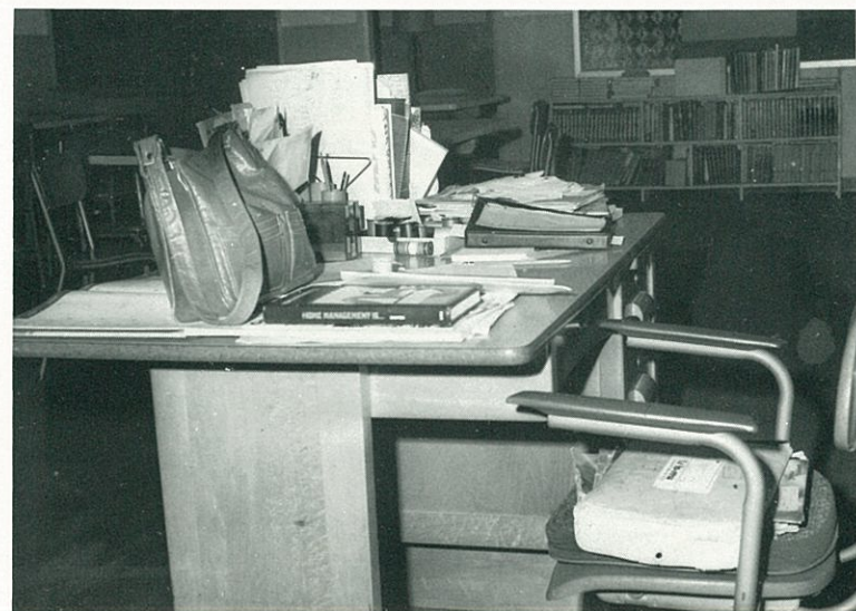
This teacher needs a vacuum!