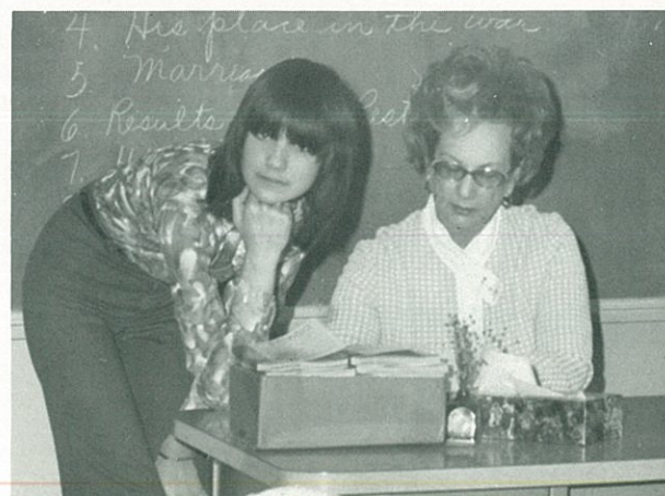
They wouldn't dare!