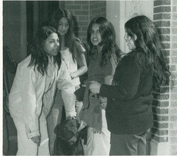
When they told me my pants were ripped!