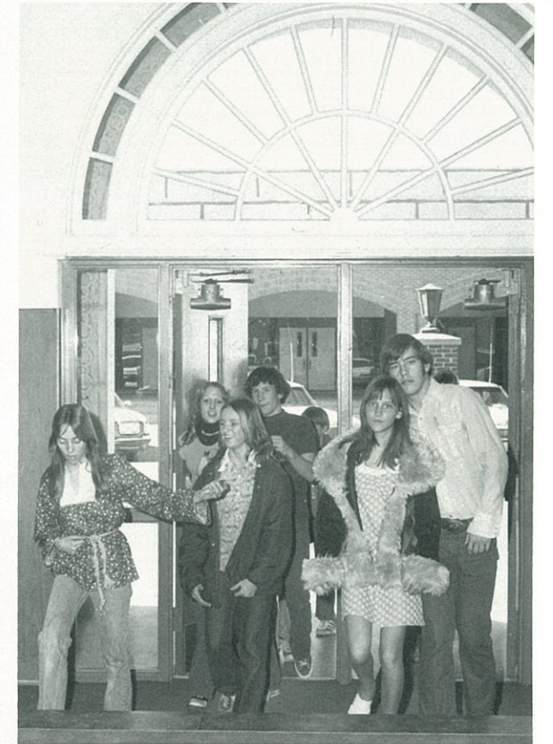
On the go! Out rather than in!