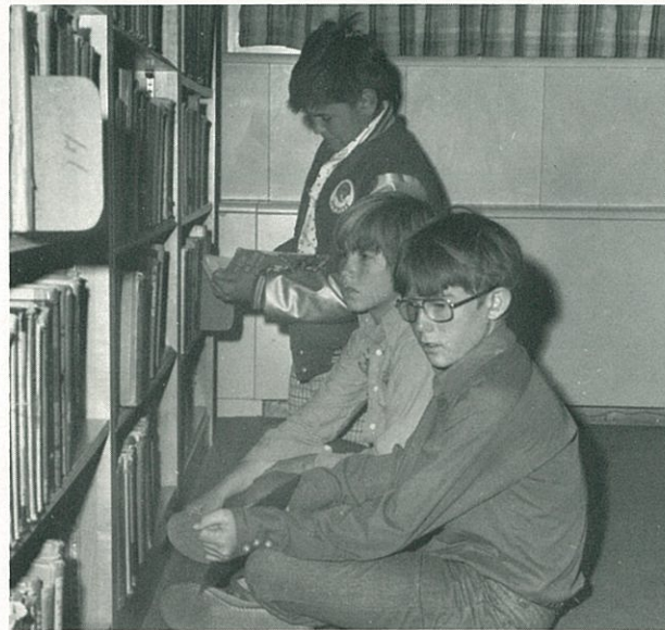
Trying to find a book for my book-report!