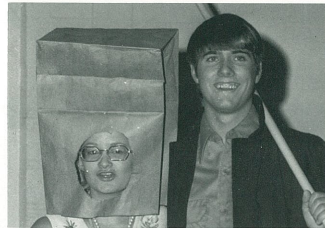
As a happy, married Couple!