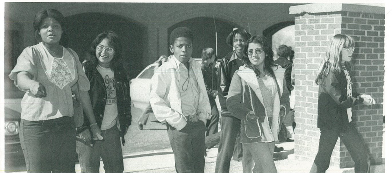
We'll think of something!