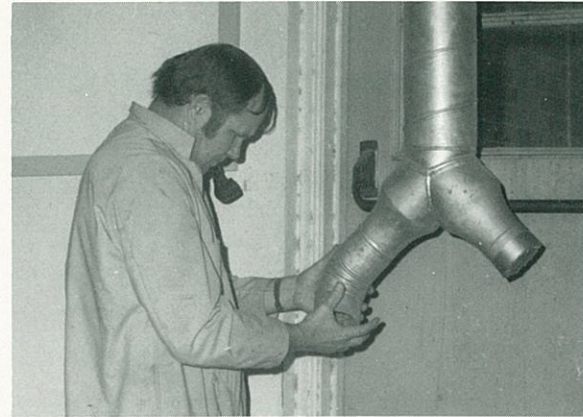
When I found a rat in the pipes!