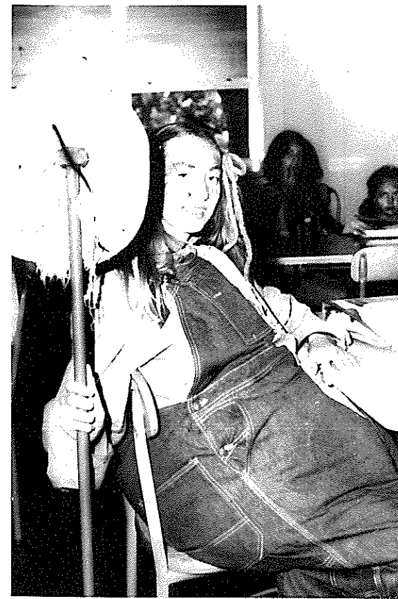
The Goodyear Blimp!