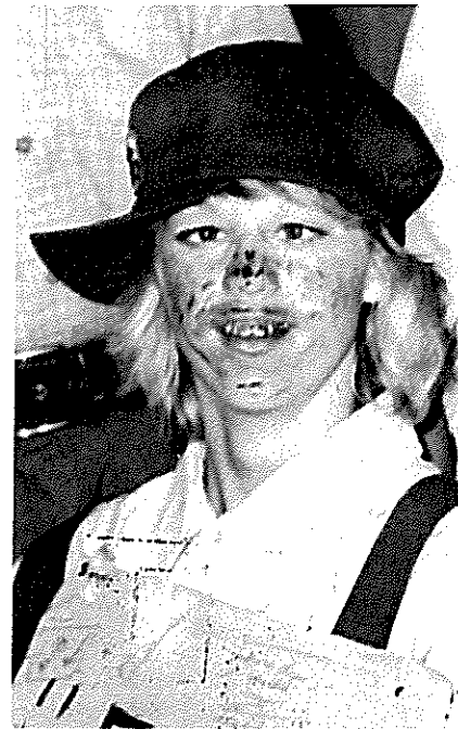
"A Thing of Beauty is a Joy Forever."