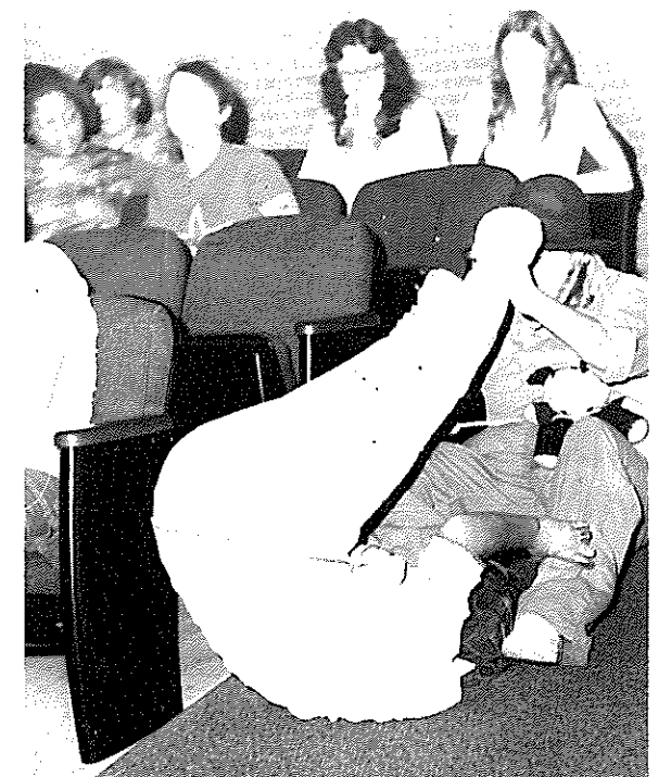
Tumbling tumble weeds!