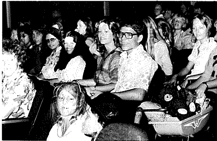
The meek and the lowly.

Slave Day means money for the Student Council, fun for upper classmen, and misery for the Freshmen. The vow they'll get even next year!