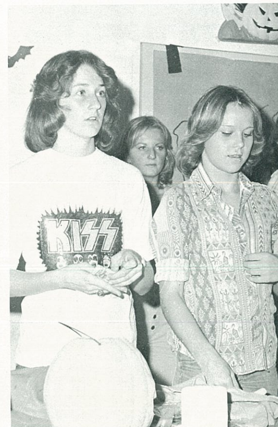
I think I see the Great Pumpkin!