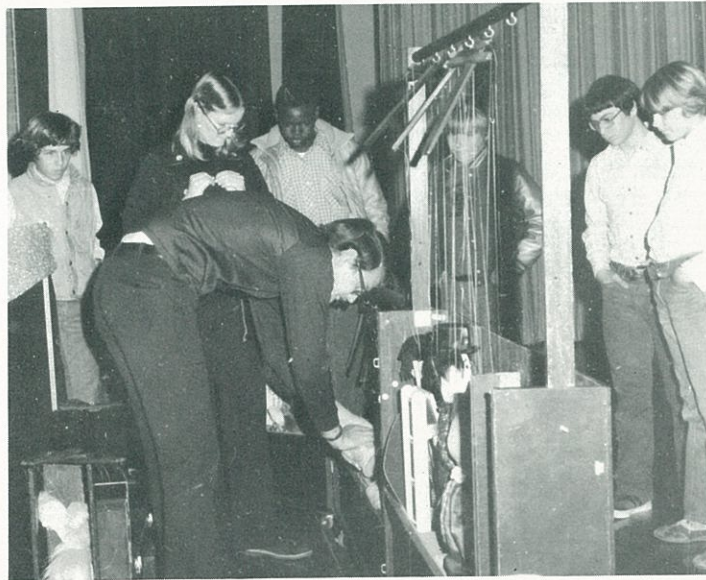
So that's how marionettes work.