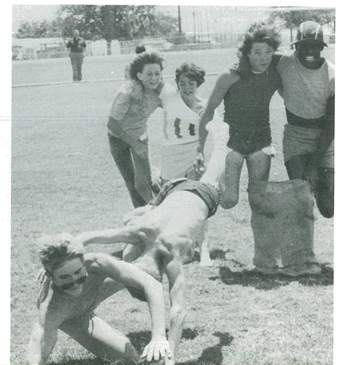
Go for the GOLD!!!!