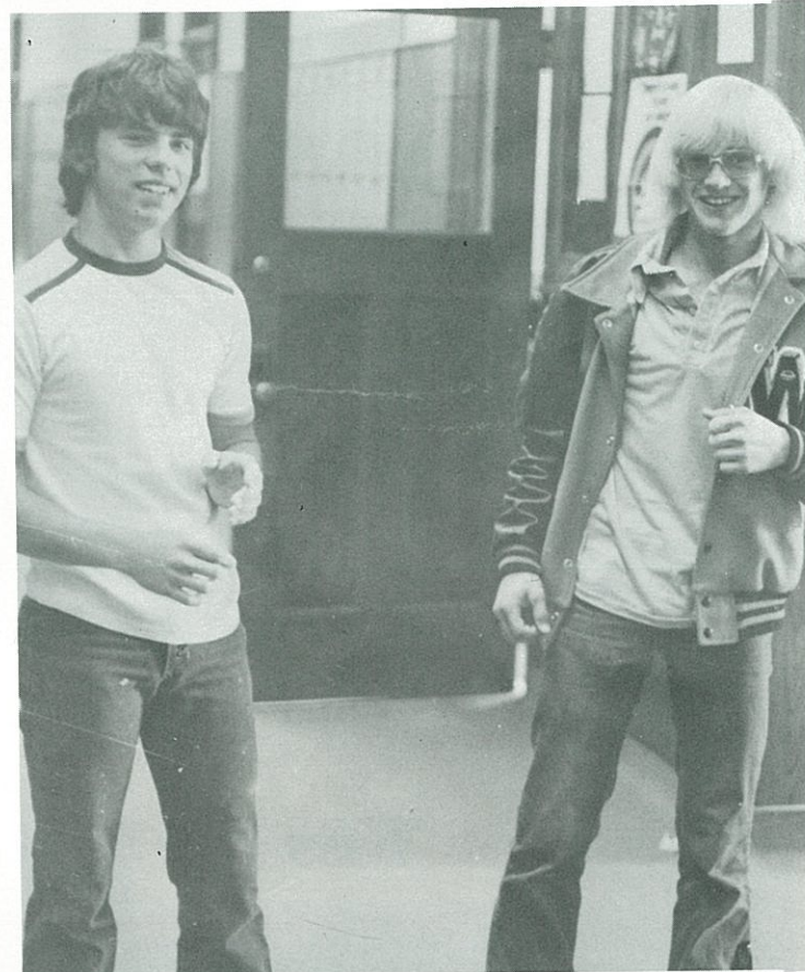
Cuttin Class Again?