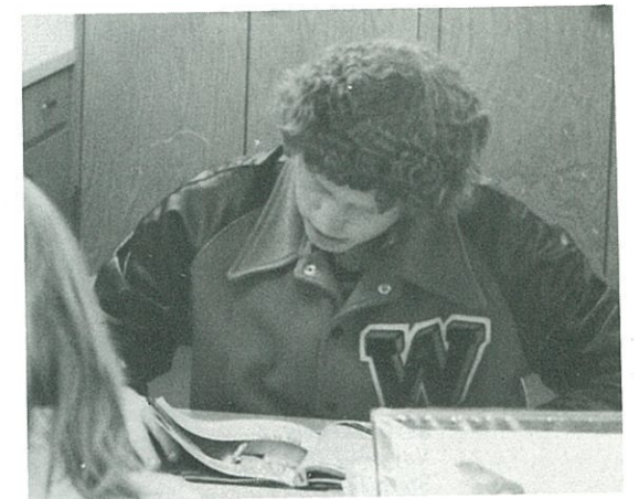
At Least One Junior Is Reading