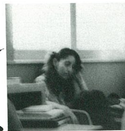
The Weekend Pays Off On Monday