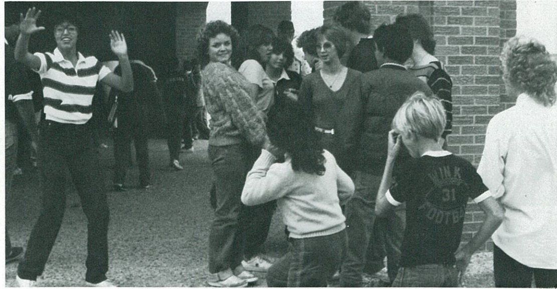
At noon, students relax and let go of some of that stored up energy held back during the morning.