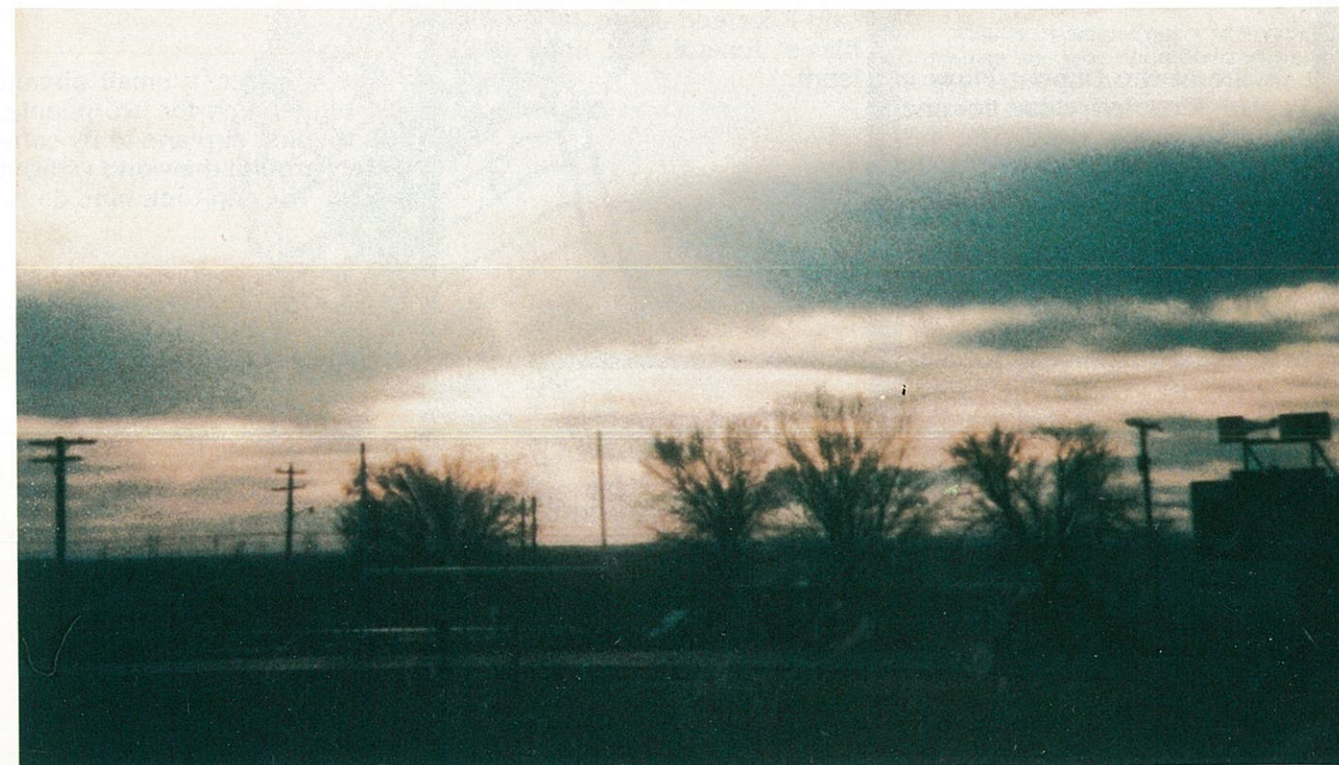
The sun rises over the playground to announce the start of a new school year. The first day would have a great effect over the rest of the year.