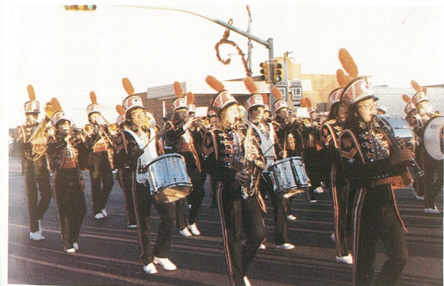
The band does a good job and is impressive as they march. They were invited to the Kermit Christmas parade to help entertain the crowd.