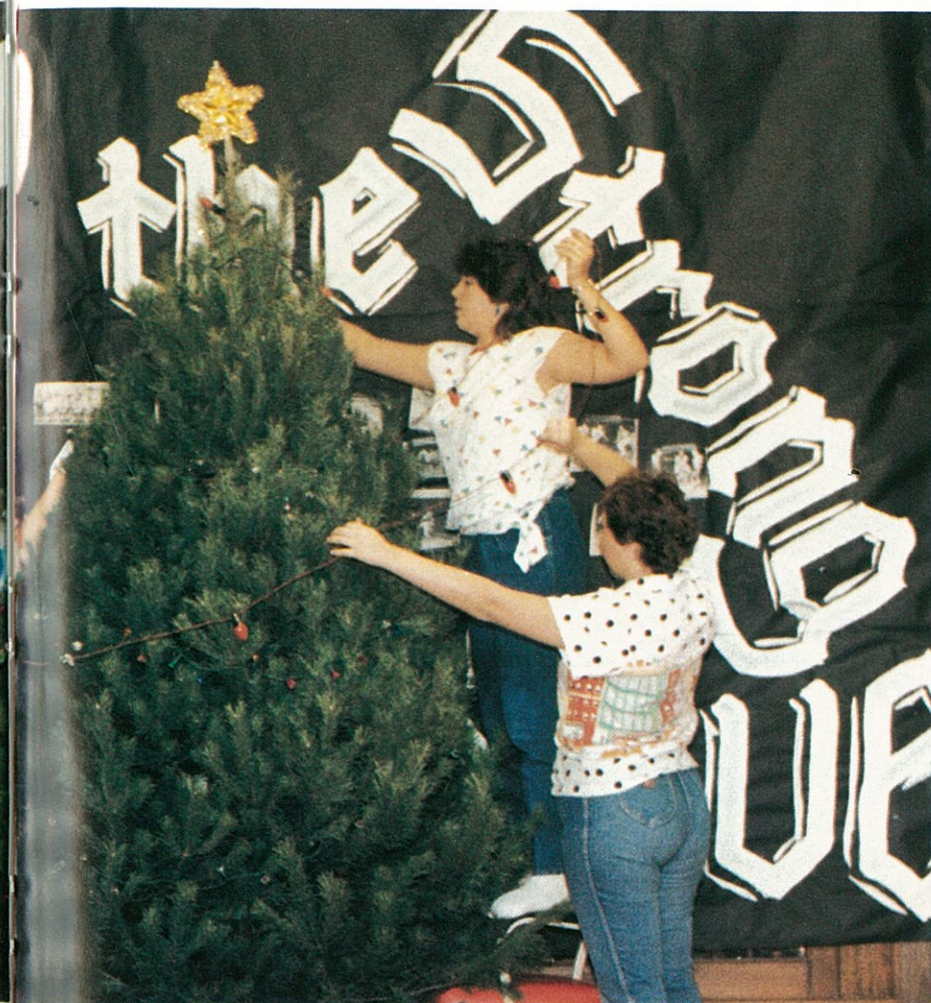
Wink students participate in decorating the tree in the high school hall. The Christmas vacation was enjoyed by all students because it provided a well needed break.