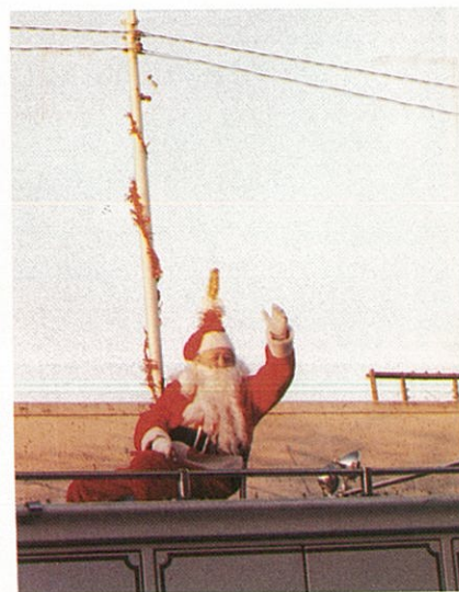
In years past Santa has been the main attraction in the parade, and is again this year. Here, we caught Santa waving at the crowd.