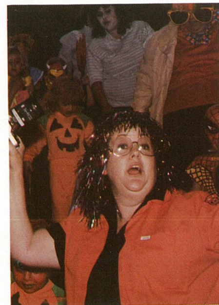
The elementary students have fun during Halloween. It seemed as though everything was orange and black during these times.