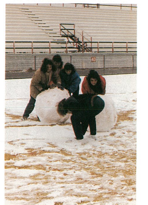
In the snow, some eighth grade girls are attempting to build a snowman. This day at school was fun for everyone because it provided a little excitement in the school.