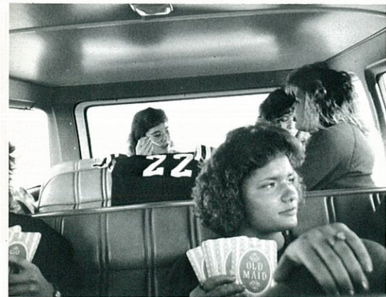
"Old Maid" is one of the things the Lady Cats did to occupy themselves on several of their long trips. When it came time to play, the Cats didn't play like "Old Maids."

Overall the Lady Wildcats had a good season. They proved many people wrong with their ability and with their new coach. They also overcame injuries throughout the year and still managed to be friends when it was all over.