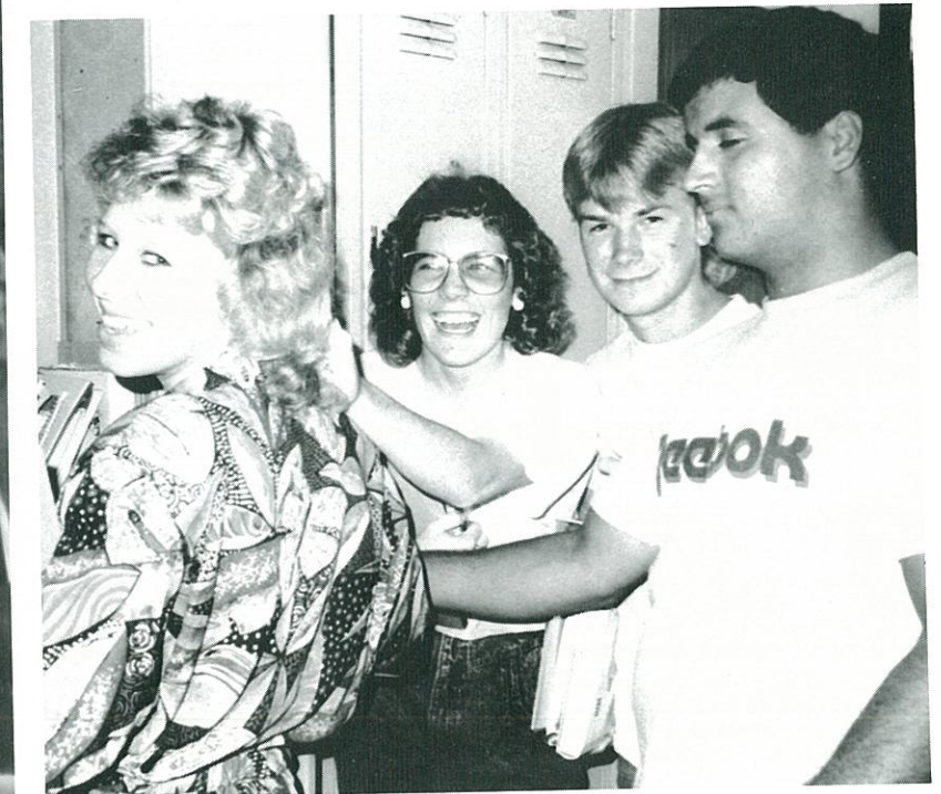
Come on, why aren't the rest of you flashing that Colgate smile?