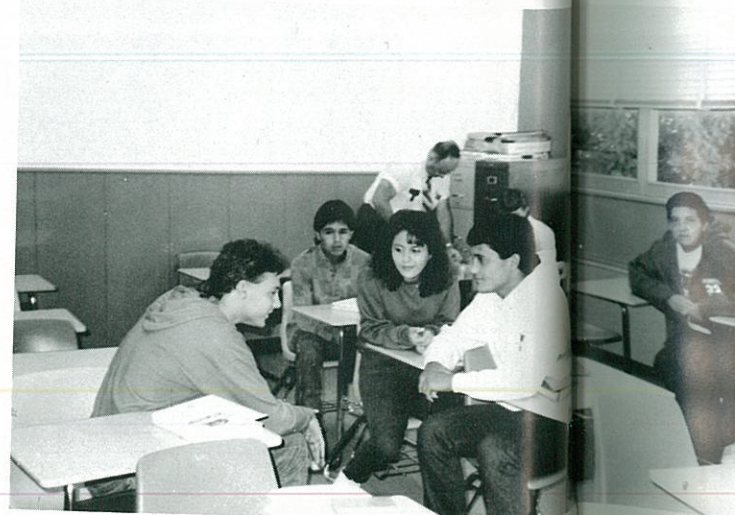
Do you really believe that consumers was the topic of this discussion?