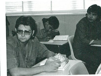
You have now entered a new dimension — the junior class — the DEAD ZONE!