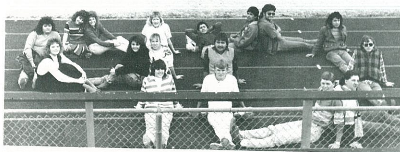
When we leave, we won't leave quietly 'cause we're the class of 1990!