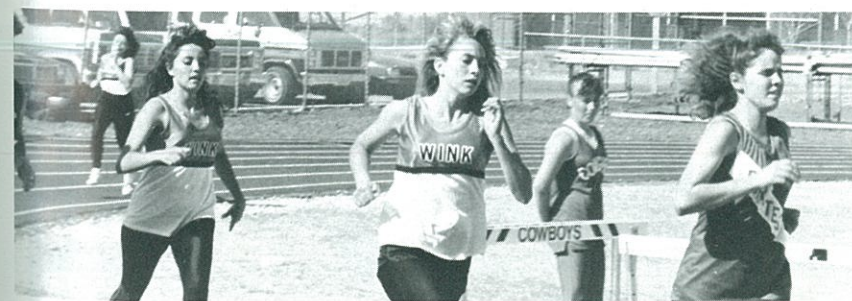
Junior looks as though the day has finally caught up with him.