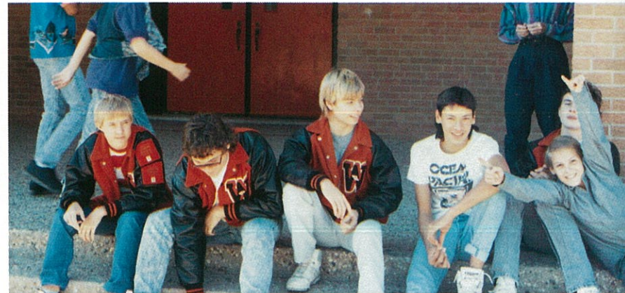
The new seventh graders seem to enjoy junior high life.