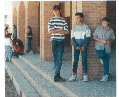
Is this Larry, Moe, and Curly or just the seventh graders?