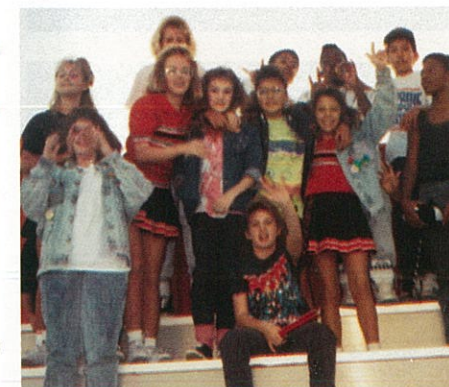
These kids are really enjoying the football game.