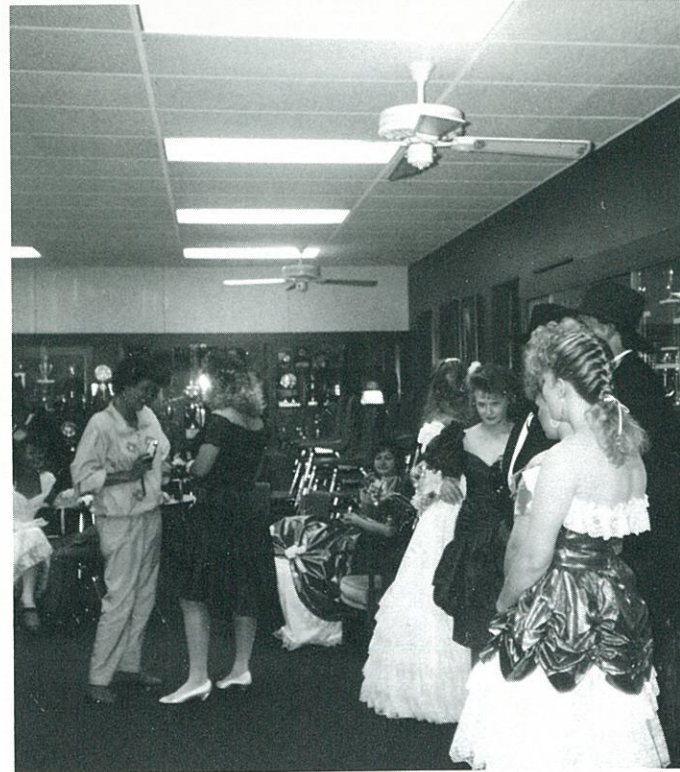
These Wildcats wait nervously for the Grand March to start.