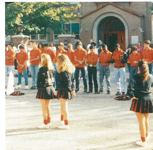
The lighting of the WW was the highlight of a community pep rally to mark the last game of the season and the Lady Cats' trip to the Regional Tournament in Lubbock.