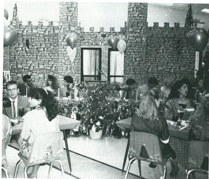
Juniors and seniors enjoyed roast beef, green beans, baked potatoes, rolls and cheese cake at the banquet sponsored by the juniors.