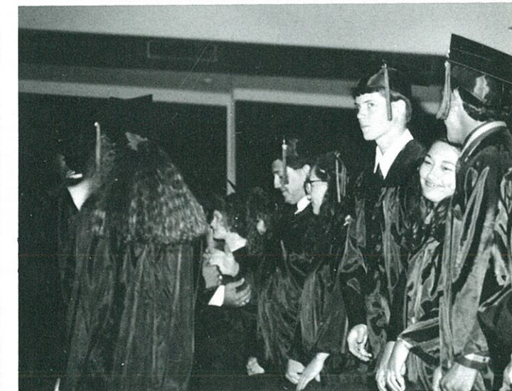
Members of the Class of 92 prepare to receive their diplomas.