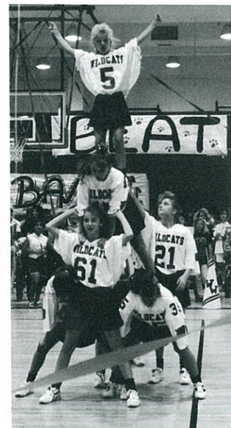
Junior high cheerleaders build that spirit up at the Homecoming pep rally.