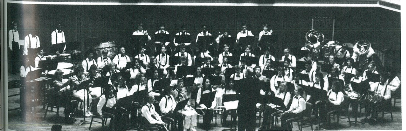
The Baad Cat Band performs on the stage of the Bass Concert Hall on the University of Texas campus in state concert contest.