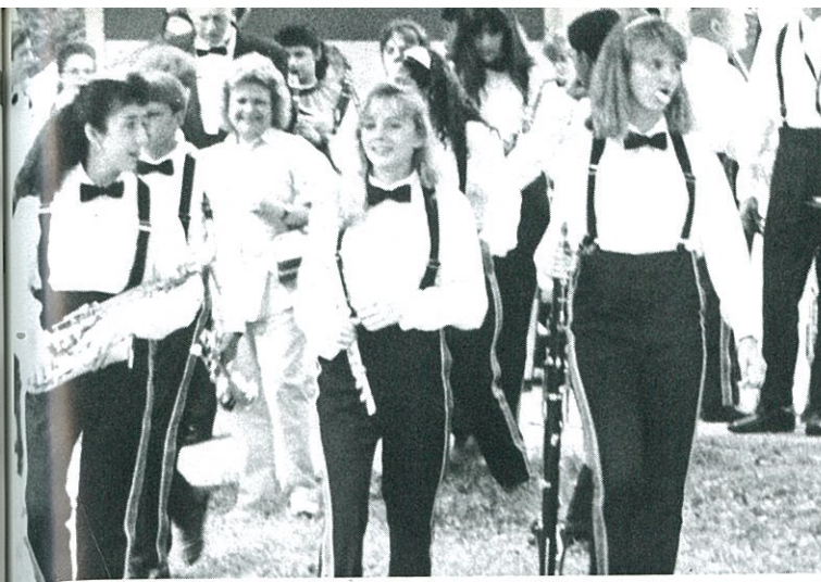
Baad Cat Band members get their horns together and walk to the Bass Concert Hall on the University of Texas campus for state concert contest.