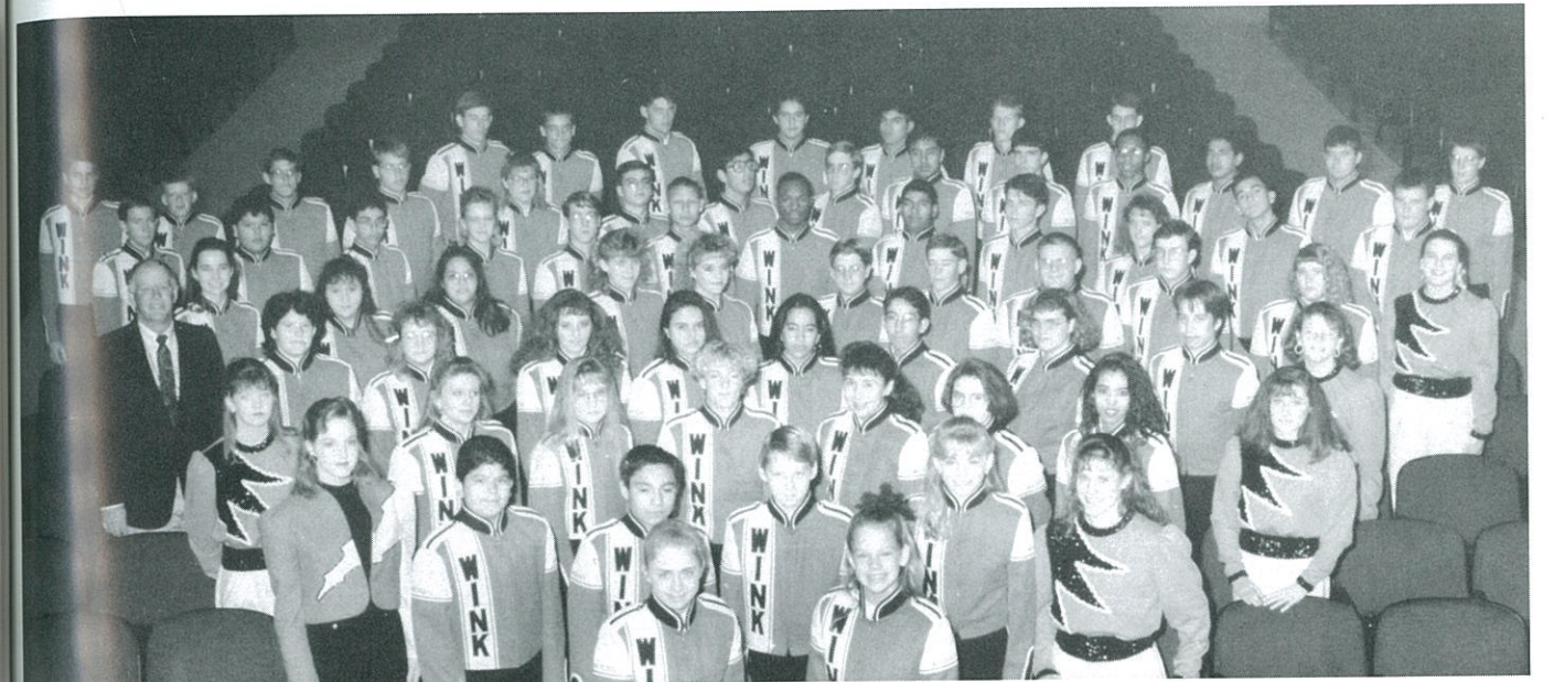
Members of the 1993-94 Sweepstakes-winning Baad Cat Band pose for a group picture in September.