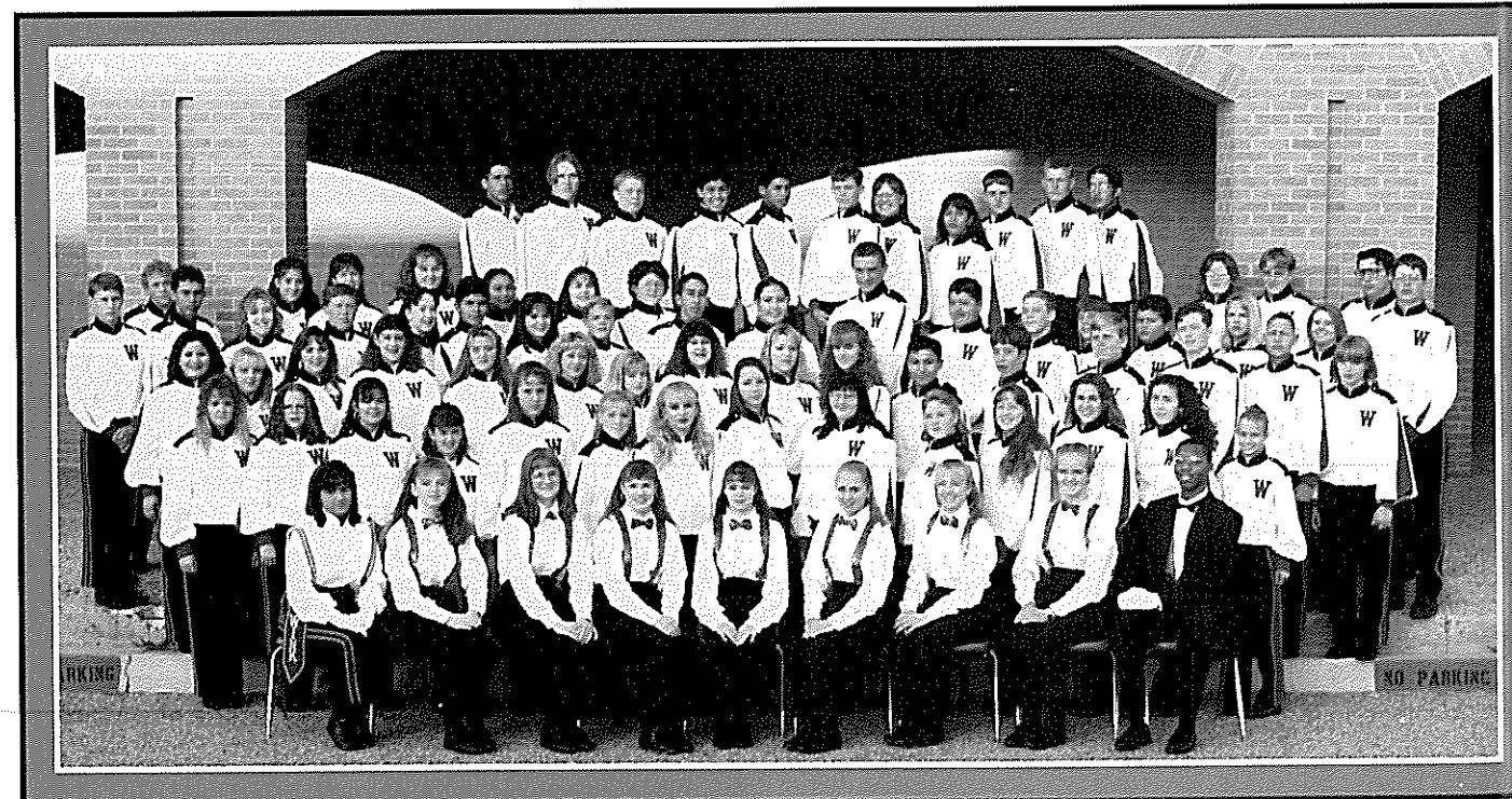
52 Baad Cat Band