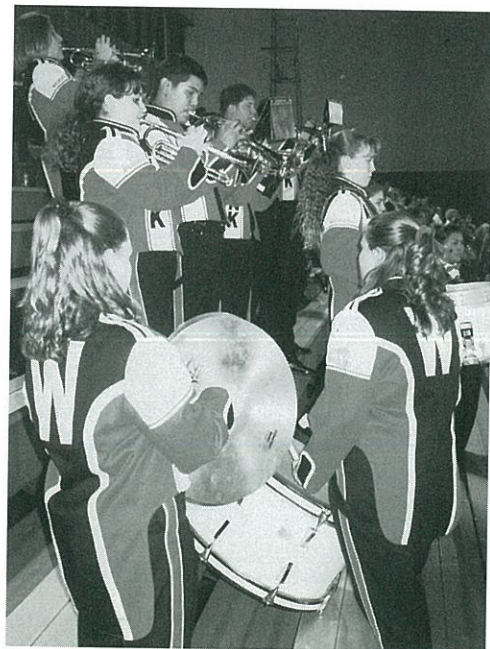
The Baad Cat Band livens up the festivities at a Friday night football game.