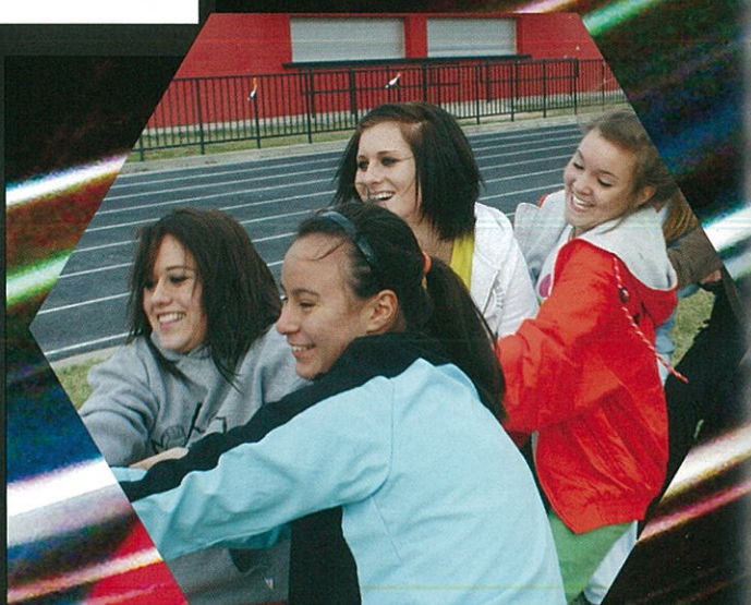
Sophomore girls in a competitive game of Tug-of-War against the sophomore boys.