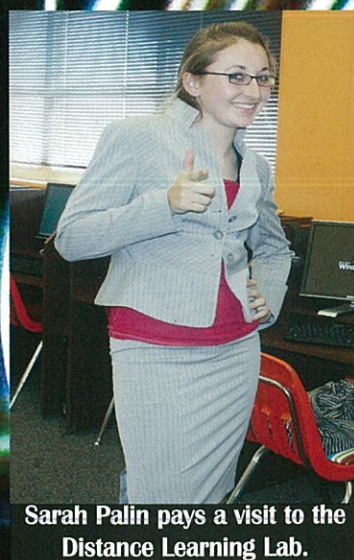
Sarah Palin pays a visit to the Distance Learning Lab.