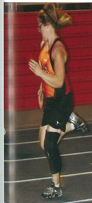
Clockwise from Bottom Left: